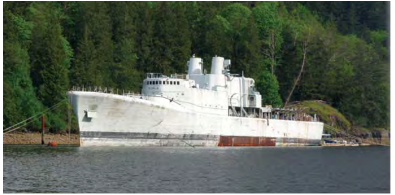
Destined for Halkett Bay Provincial Marine Park in Howe Sound, the Annapolis, is a 371-foot (111 metre), 3,000 ton helicopter-carrying destroyer escort. It is the sixth ship in the ARSBC's destroyer program to be prepared for sinking as an artificial reef.

hazards, volunteers remove scrap materials for resale, such as brass, steel, copper, aluminum and other high-grade metals. Other items, such as doors and machinery, are sold for reuse on other ships.